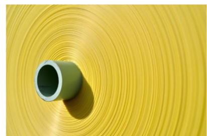
The closed-loop project fits perfectly with the offering aimed at companies from Herambiente.

The closed-loop processes designed by Aliplast boast great flexibility, to the point of meeting not only the needs of a single company, but of a whole industrial district . An example is that of the Modena ceramic supply-chain . For product types and quality, this is a unique area in the world , with a high number of contractors who cover different