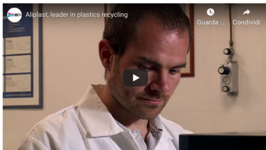
Since 2017 Aliplast has become part of Herambiente Group, a company of the Hera Group and the first national operator in the treatment of all types of waste.

Its name is “closed-loop” and it has been developed by Aliplast, a Gruppo Hera company and European leader in the production of flexible PE films, PET sheets and regenerated polymers. A circular system that allows for the introduction of plastic materials in the recycling cycle, reducing costs and impact on the environment. The closed-loop system can be leveraged by companies in industries such as packaging (for food and beverage) and ceramics